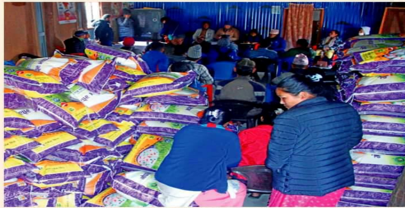
Sacks of rice kept standby to distribute to the hail-affected farmers in Ward No. 2 of Chichila Rural Municipality in Sankhuwasabha, Saturday.

According to Rai, the relief was handed in proportion to