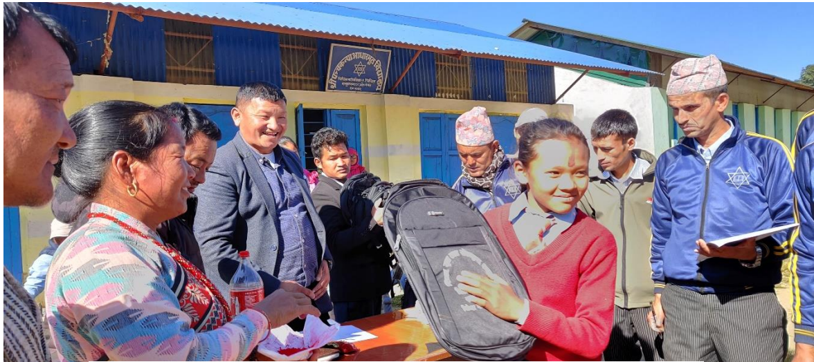
Providing Educational Materilas