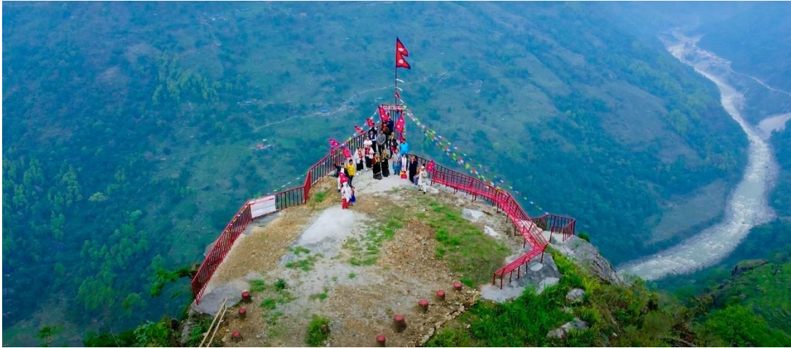
Chuchche Dunga at Chichila Rural Municipality, Ward No. 2