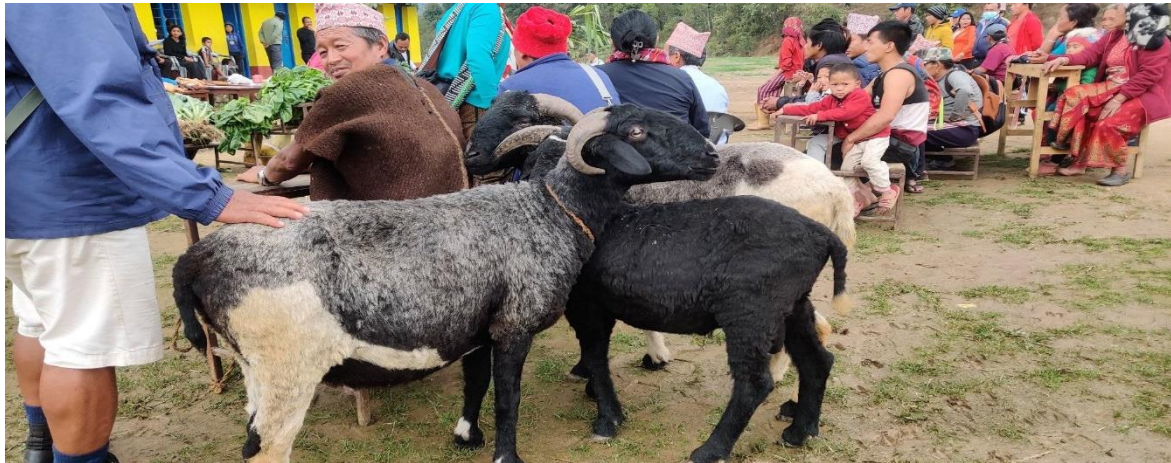
Agricultural and Animal Mela