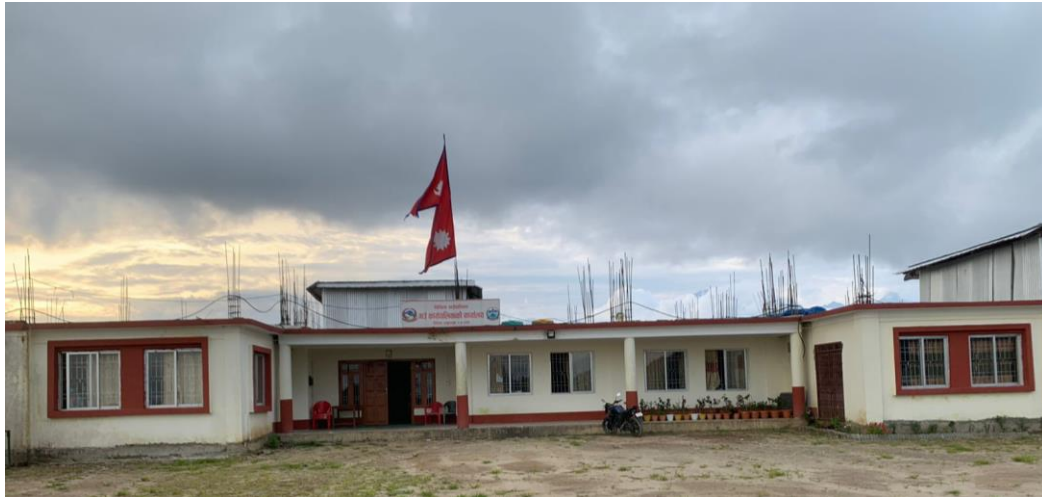
Office of Chichila Rural Municipal Executive