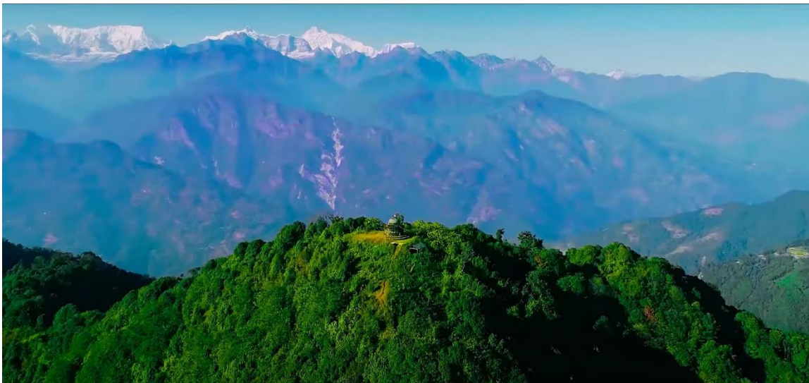
Balutham Stupa height of 2350M from sea level, Chichila Rural Municipality Ward no. 1,3 and 4

Chichila, Sankhuwasabha Koshi Province, Nepal