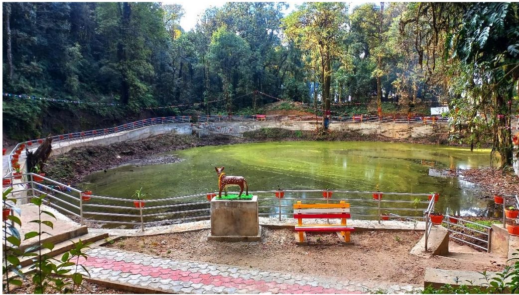
Kaptane Pokhari at Chichila Rural Municipality, Ward No. 4