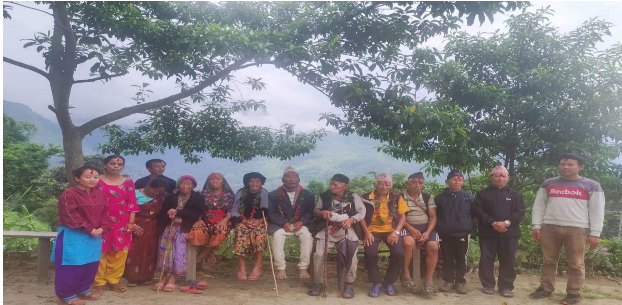
Tree of Rudrakshya