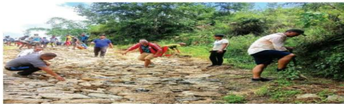
बाढीले बाढी बनाएको सडकलाई पुर्ने सल्लाह हान्ने चिचिलावासी।