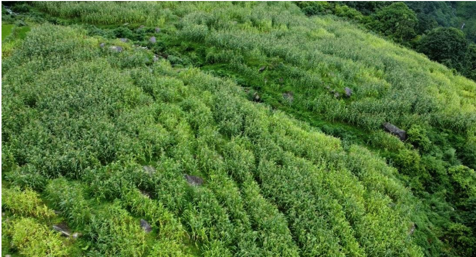
“Pani Makai” Corn Farming