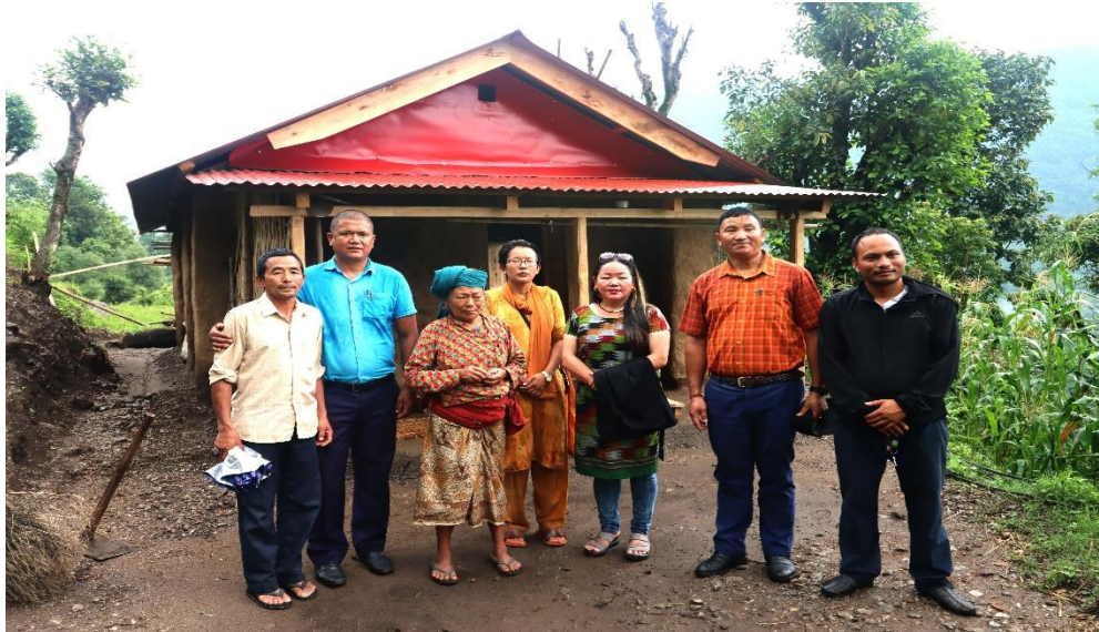
Hand overing a poor civil housing construction at Chichila Rural Municipality, Ward No. 4

Chichila, Sankhuwasabha Koshi Province, Nepal