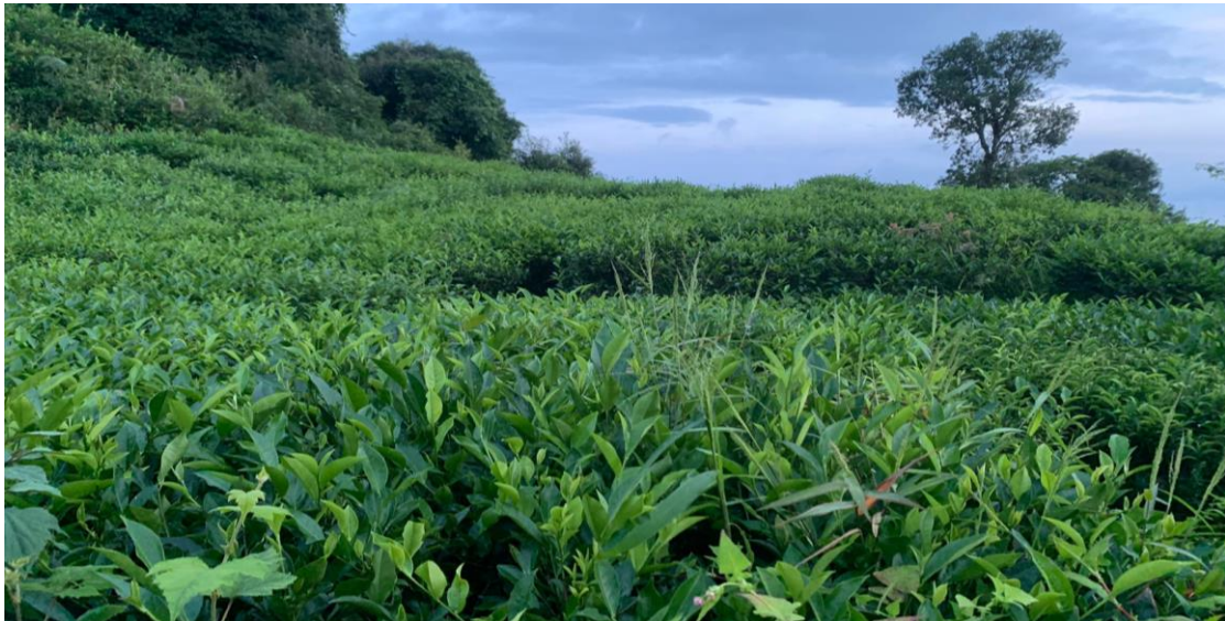
Green tea Farming