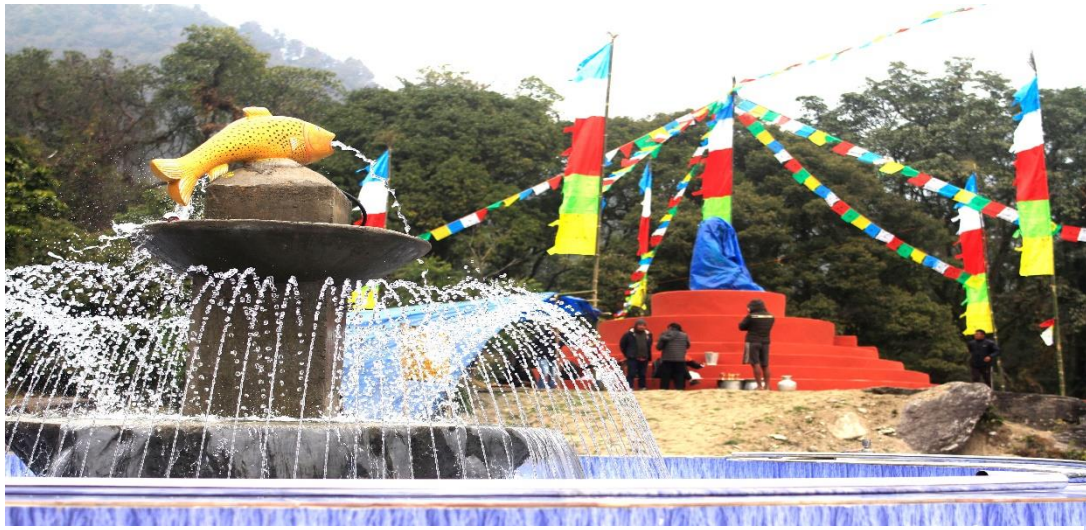
Statue of Gautam Buddha and Fish at Chichila Rural Municipality, Ward No. 4