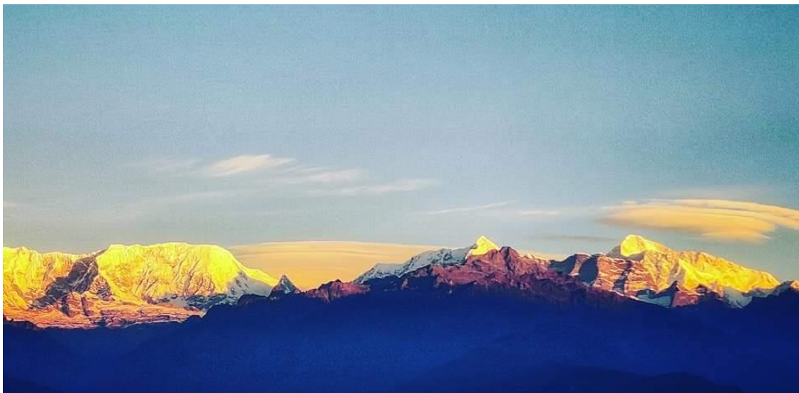
Sunrise view of Mt. Makalu from Chichila bazar