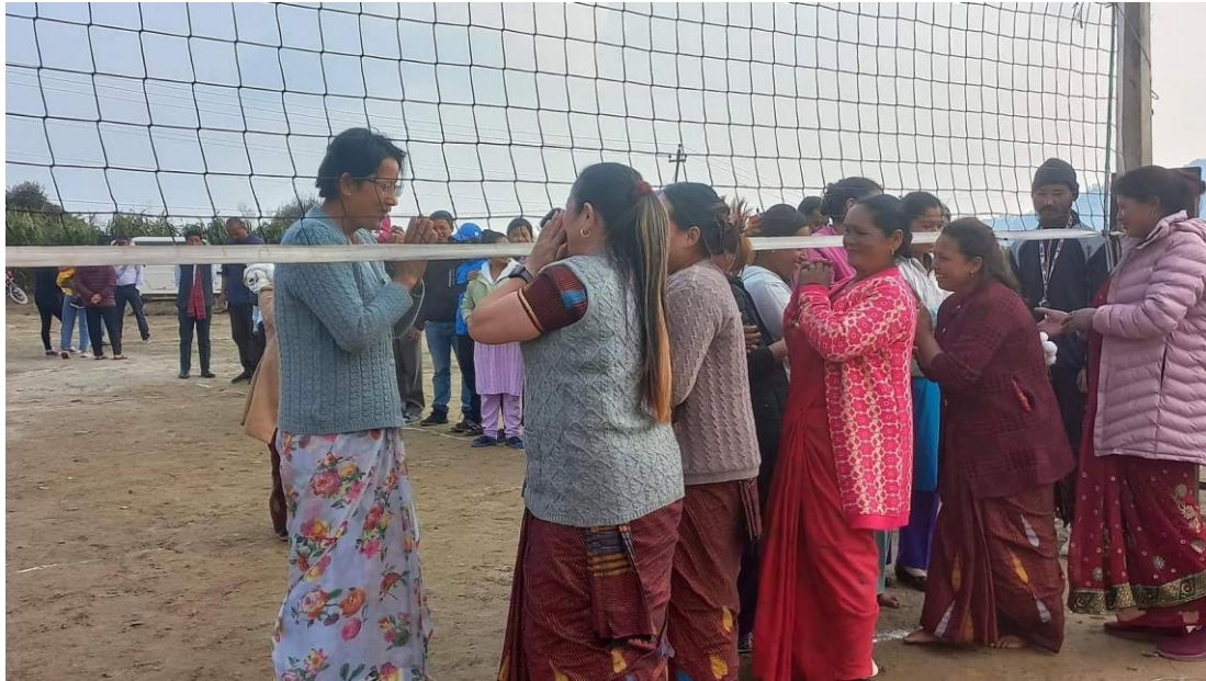
Female Volleyball game Organized by Chichila Rural Municipality