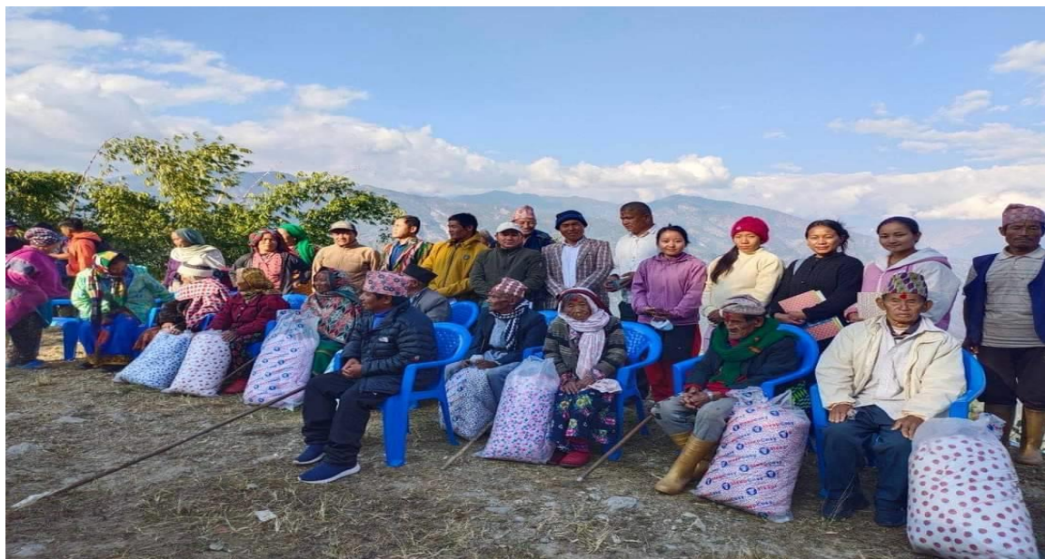
Distribution of warm materials aged people